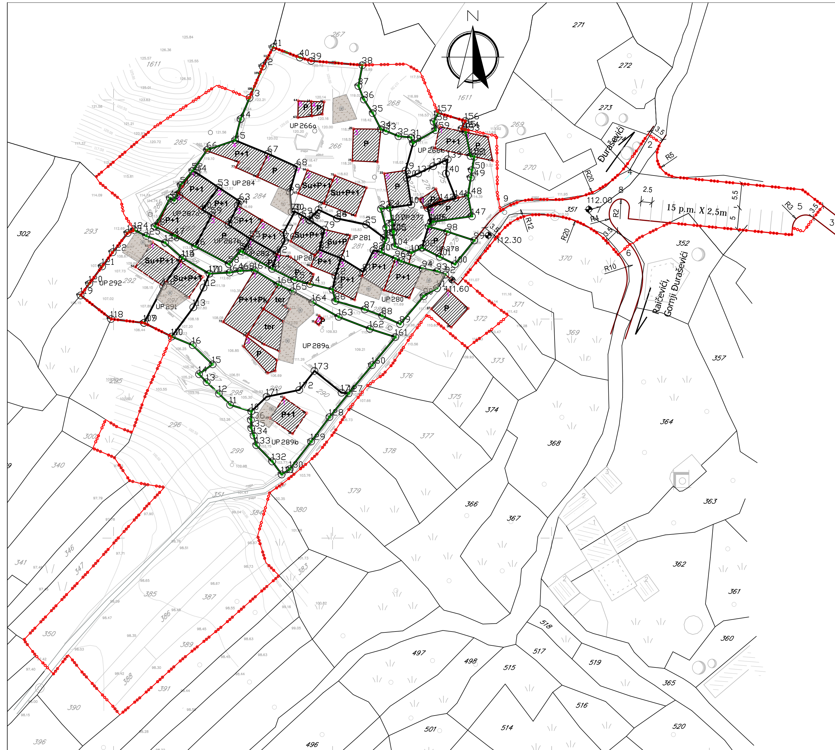
Koordinate lomnih tačaka granica urbanističkih parcela